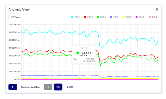
Figure 2 - SenseiAQ Analysis View