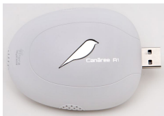
1. Canāree Sensor