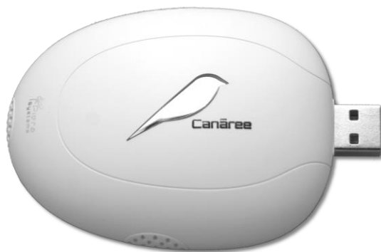
Fig. 1. Canāree AQM

Canāree utilizes Piera's Intelligent Particle Sensor series 7100, and Bosch BME688 (I5 models). Using data from the sensors and unique algorithms to identify different particulate sources, Canāree can classify sources of air-pollution such as smoke (tobacco, wildfire), vape, cooking, dust and noxious gas detection for indoor applications. Embedded gas sensor within Canāree is also capable of measuring the sum of VOCs/contaminants in the surrounding air providing orthogonal information regarding the ambient air.