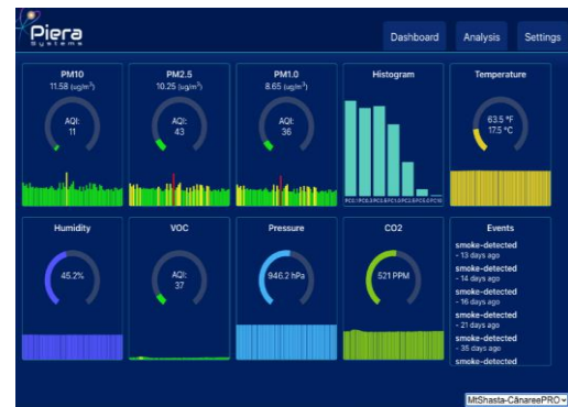
Fig. 2. SenseiAQ software

Piera Systems Inc. reserves the right to make corrections, modifications, enhancements, improvements and other changes to its products and services at any time and to discontinue any product or service without notice. Please contact Piera Systems anytime to obtain the latest relevant information. This datasheet is for firmware versions V1.9.10 or higher.